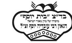
Bet Din Zedek/Bet Yosef Hacham Rav Ovadia Yosef zt"l