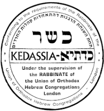
Kedassia of London, UK