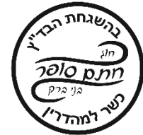
Chug Chatam Sofer of B'nei Brak