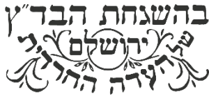
Eida Hachereidus Badatz of Yerushalayim